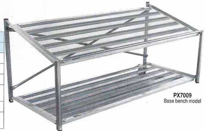
PX7009 Base bench model