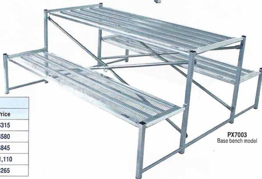
PX7003 Base bench model