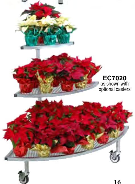
EC7020 as shown with optional casters