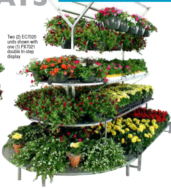
Two (2) EC7020 units shown with one (1) PX7021 double tri-step display

Our new end caps for the Evolutions series are configured to match up with their corresponding display! They still feature expanded metal benchtops, galvanized steel construction for strength and durability and are now also available with optional casters. Use them by themselves in many configurations or with displays to feature and merchandise your product. End caps are also great for sale items or as a focal point from which you can attach signage.