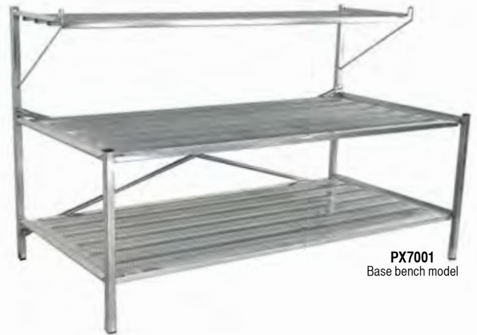
PX7001 Base bench model

The purlin available for this display is now a double purlin—twice the baskets in the same footprint!