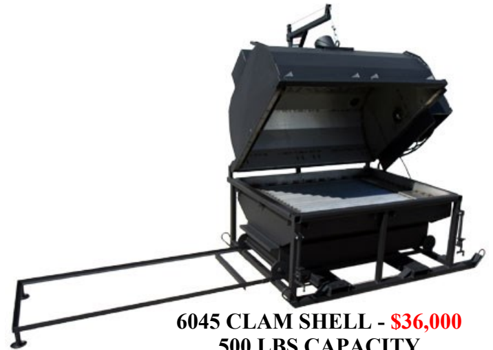
6045 CLAM SHELL - $36,000 500 LBS CAPACITY