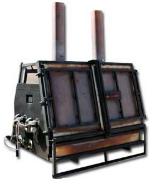
PHOENIX 8460-4 - $61,500 1200 LBS CAPACITY