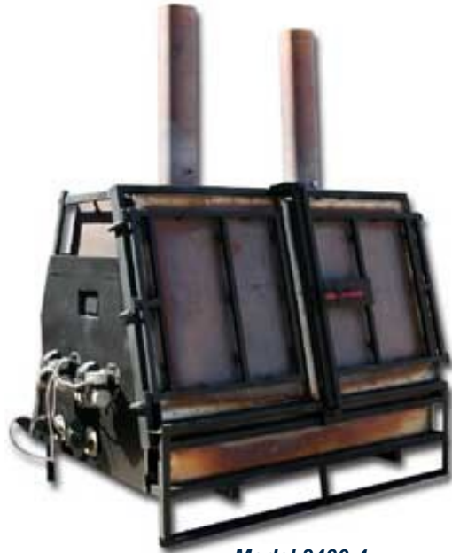
Model 8460-4 1200 Lbs. Capacity