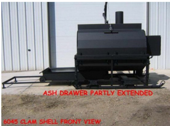
ASH DRAWER PARTLY EXTENDED