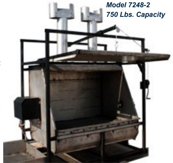
Model 7248-2 750 Lbs. Capacity

As with all Phoenix incinerators, the products are reduced to clean, dry ash which can be easily removed from the drawer style ash tray and disposed. The high operating temperatures ensure that, regardless of the type of animal infection, the products are safely and sanitarly burned.