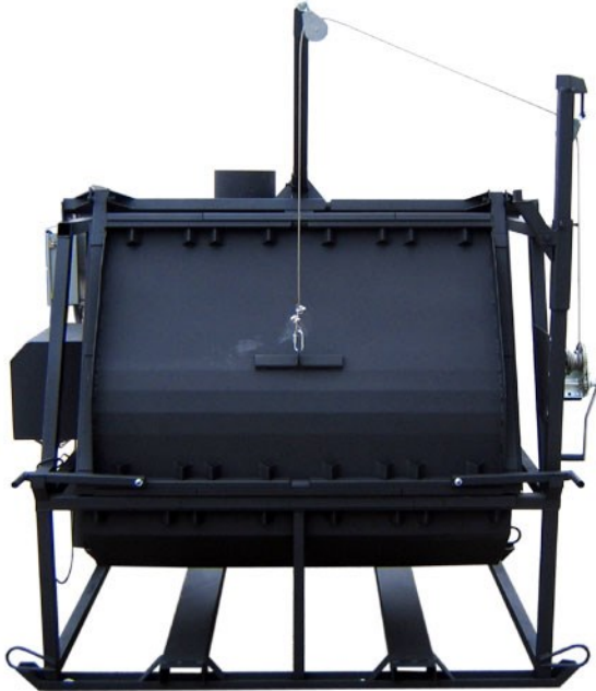
6045 FRONT LOADER - $36,500 500 LBS CAPACITY