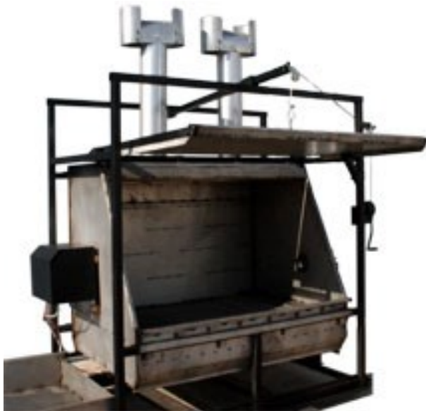
7248-2 MODEL - $44,500 750 LBS CAPACITY