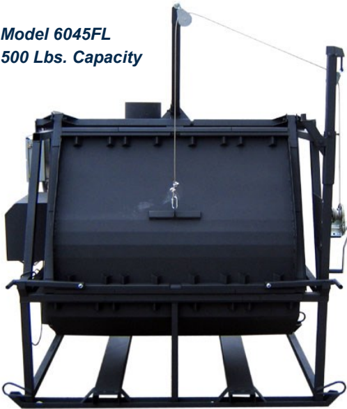
Model 6045FL 500 Lbs. Capacity

10 gauge 309 Stainless Steel chamber with 24 individual 1 x 3 inch (25.4 x 76.2 cm) grates. Heavy duty external steel frame.