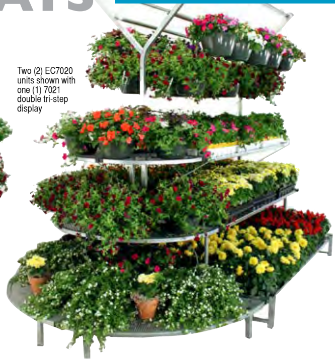
Two (2) EC7020 units shown with one (1) 7021 double tri-step display

Our new end caps for the Evolutions series are configured to match up with their corresponding display! They still feature expanded metal benchtops, galvanized steel construction for strength and durability and are now also available with optional casters. Use them by themselves in many configurations or with displays to feature and merchandise your product. End caps are also great for sale items or as a focal point from which you can attach signage.