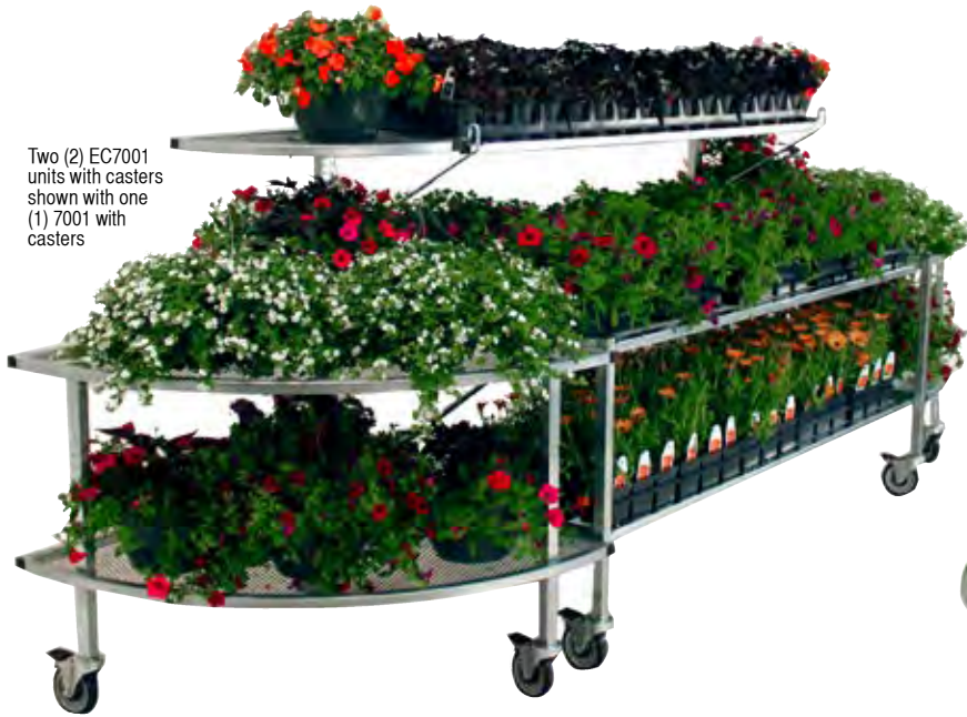
Two (2) EC7001 units with casters shown with one (1) 7001 with casters